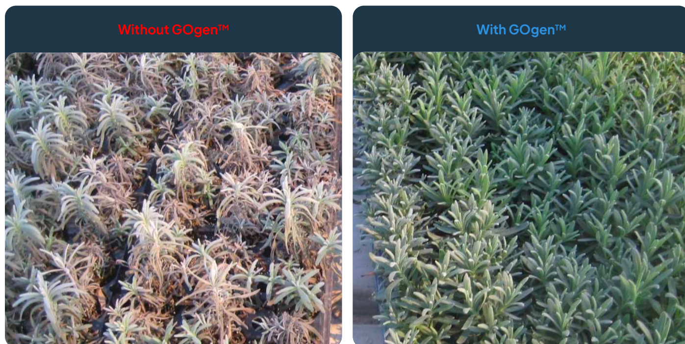
Lavender crop without GOgen™ (left), and with GOgen™ (right).

After dosing Peroxide UltraPure™ the differences in plant development became very evident, as shown in the comparative picture of lavender crop: