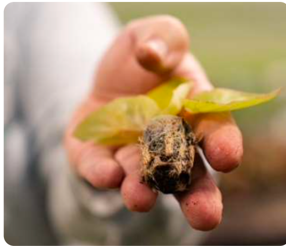
Detail pictures of the root zone of plants with GOgen™.

These benefits directly translated to the bottom line of Peace Tree Farm, which observed a better consistency in their plants, with all batches behaving in a predictable manner that enabled improved financial planning and profitability.